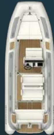
D I E S E L J E T 625 11 PERSONS