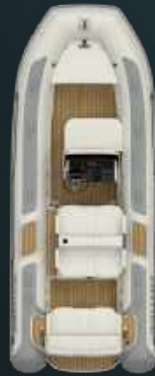
D I E S E L J E T 505 8+1 PERSONS