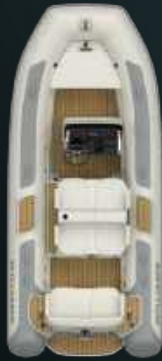
D I E S E L J E T 445 7+1 PERSONS