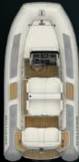
D I E S E L J E T 415 6 PERSONS