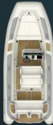
D I E S E L J E T 565 9 PERSONS